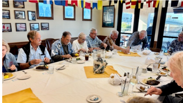
Attendees being served dinner