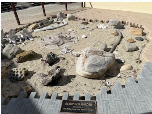
Octopus's Garden sponsored by Ringo Starr

A very fun day of learning and camaraderie among 18 of our boating friends!