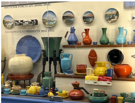
Pottery made on Catalina Island