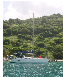
British Virgin Islands

A 5-week course covering: Preparation, Boat Selection, Provisioning and Meals, Chartering, Communications, Security, Safety Equipment, Anchoring, Weather, Foreign Travel, Boat Systems, and Handling Emergencies.