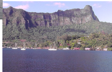
Moorea, French Polynesia