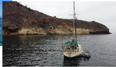
Santa Cruz Island