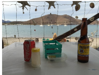
Sea of Cortez, Mexico