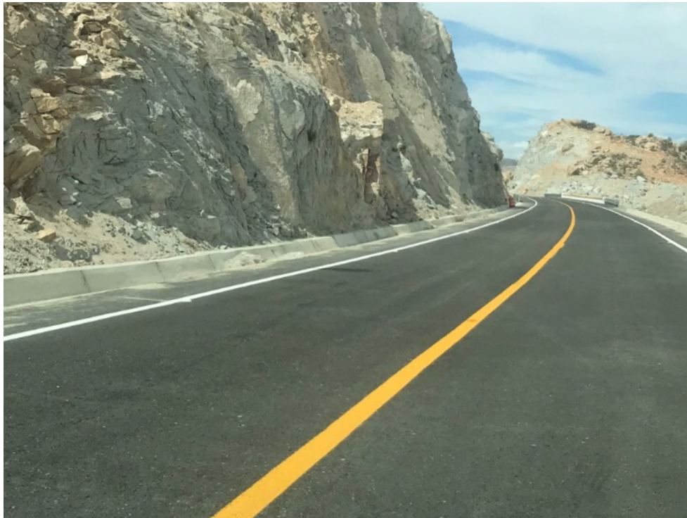
The great new better best MEX 5 — through moonlike terrain

or 5 and Mexicali ? We planned to find out on a return trip in April, but unfortunately the Corona thing got in the way and we had to cancel the trip.