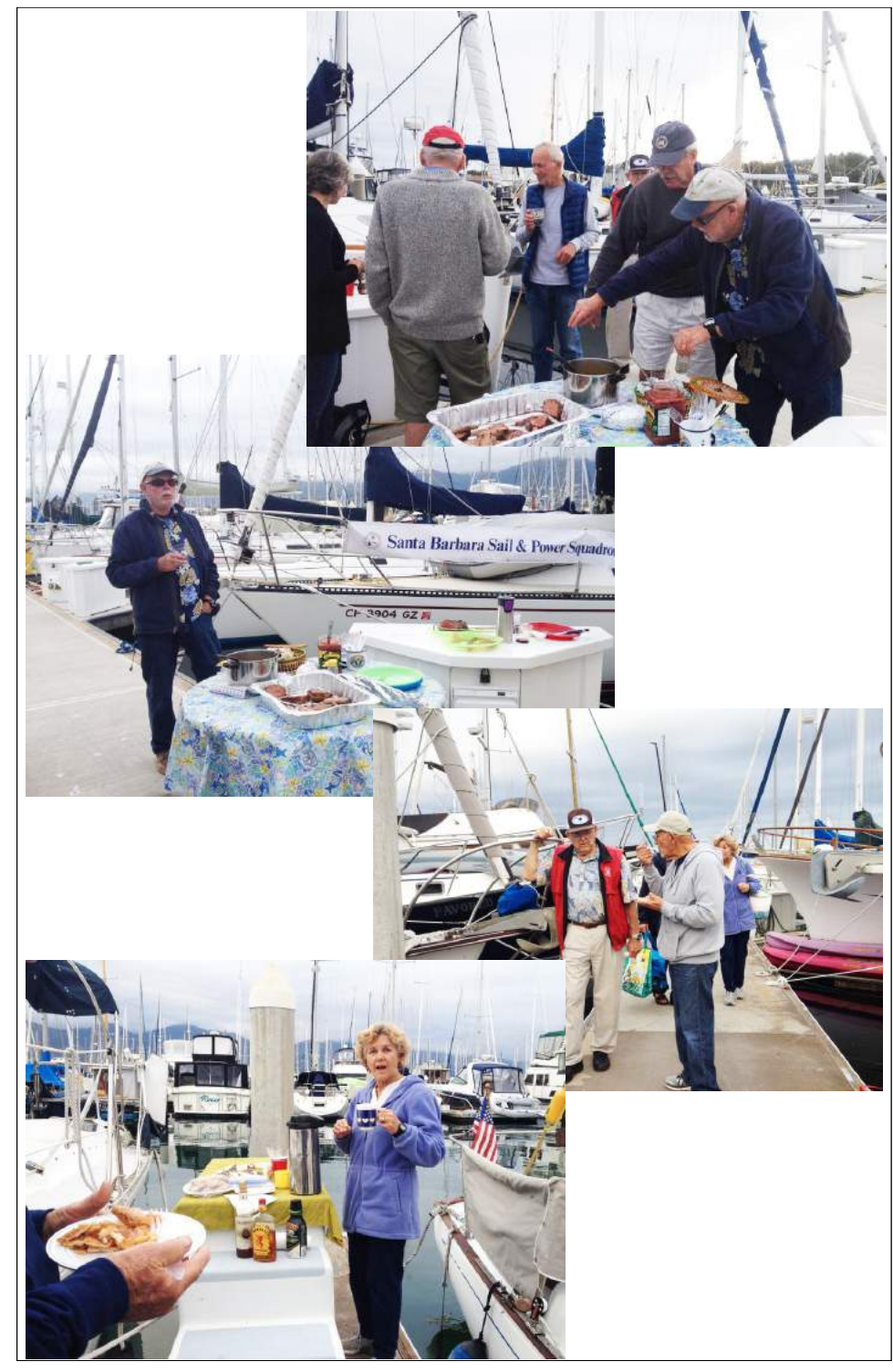
Signal Hoist Page 9