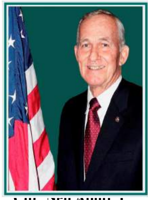
Cui. Nen Abnu, i .

The DROUGHT continues - no let up in They say this is the longest lasting drought in recent times. So why would it rain the day of the Progressive Dinner? TIMING! It's all timing, but that didn't dampen enthusiasm for the dinner. By the time 1700h rolled around the rain had stopped and there were plenty of hungry squadron members mingling and enjoying fabulous fare. And the TIMING of the rain-