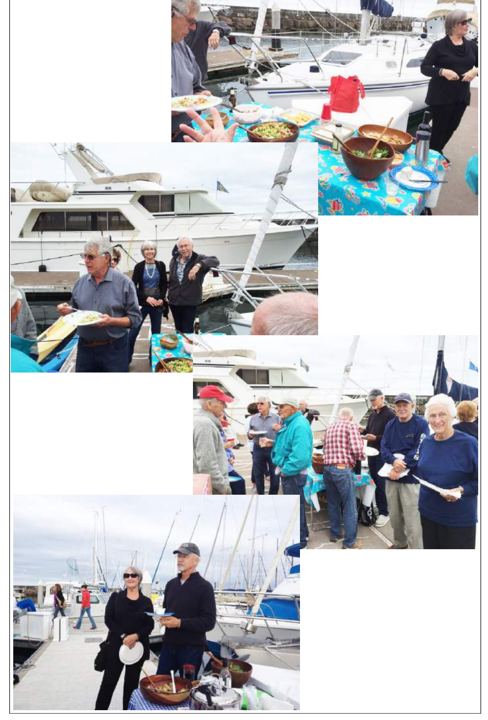
Signal Hoist Page 7