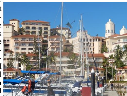
Marina at the Foot of Grande Isla Navidad Resort in Barra de Navidad.